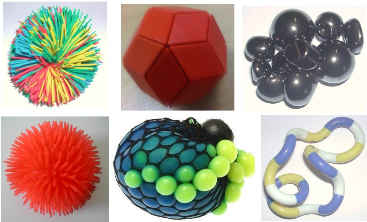
Figure 4: Calming objects: (clockwise from top left) koosh ball, magnetic ball, magnets, tangle toy, squishy mess ball and stress ball